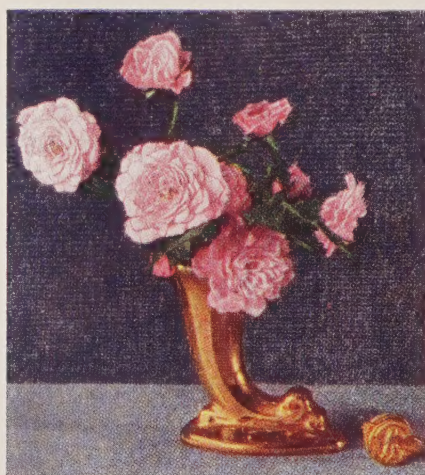
SWEET FAIRY (P.R.R.)